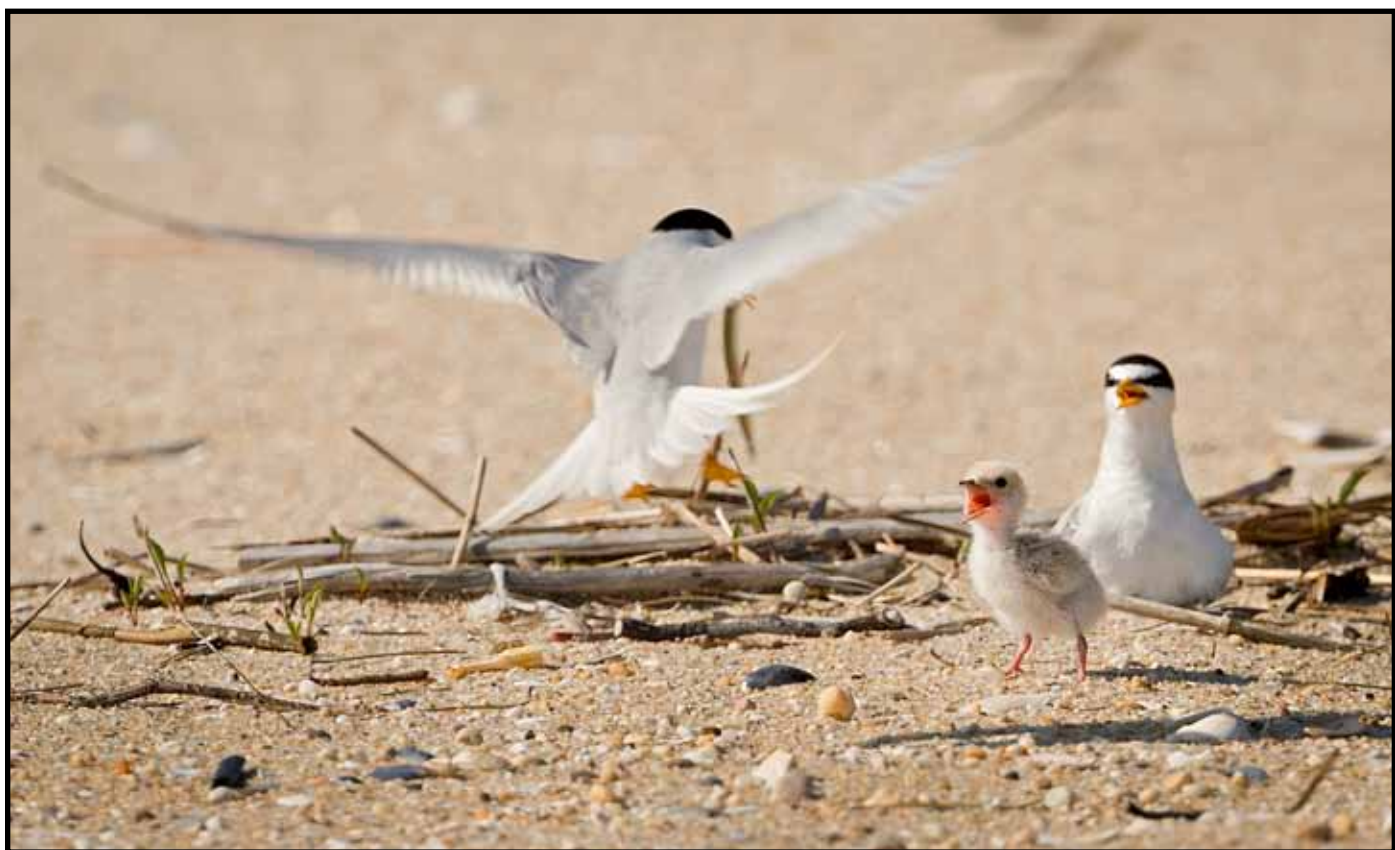
Dad's Bringing Home Some Breakfast