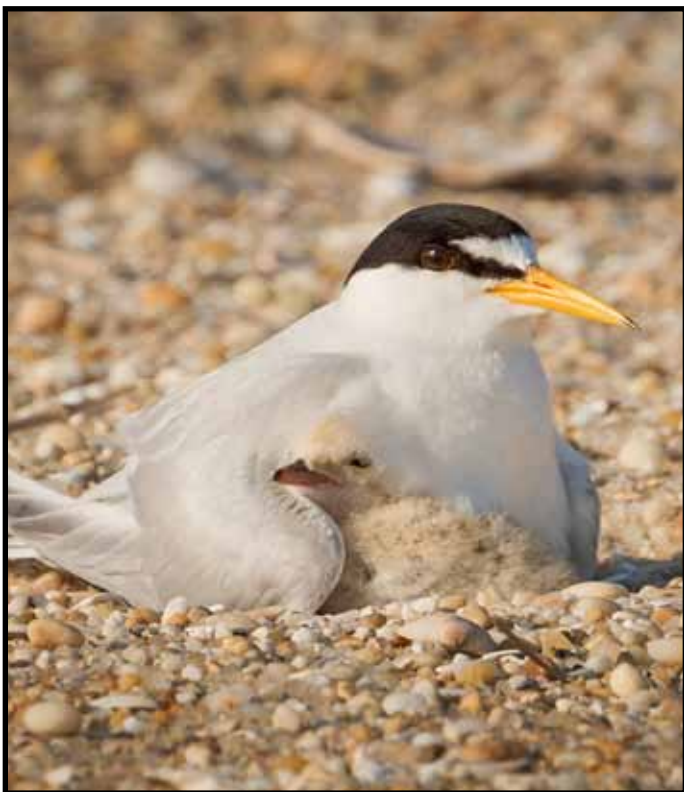
Least Tern And Chick.